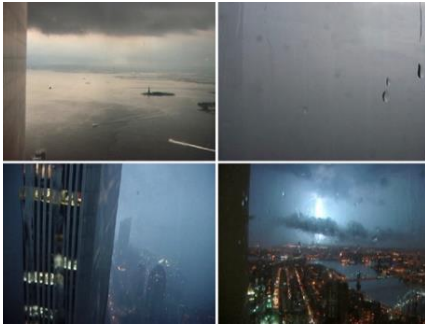
Click here for video file.