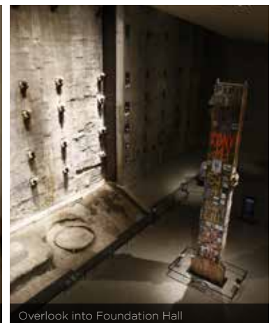
Overlook into Foundation Hall