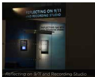
Reflecting on 9/11 and Recording Studio