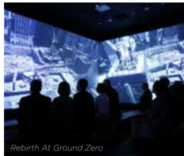
Rebirth At Ground Zero