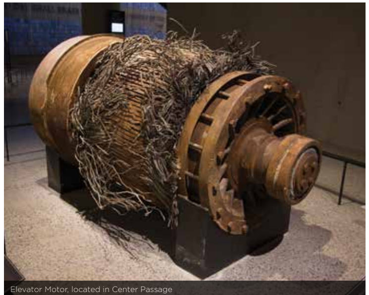
Elevator Motor, located in Center Passage