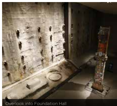
Overlook into Foundation Hall