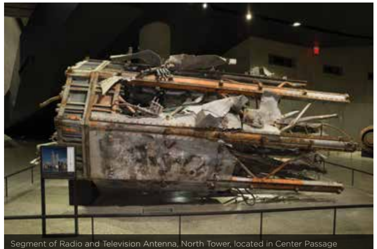
Segment of Radio and Television Antenna, North Tower, located in Center Passage