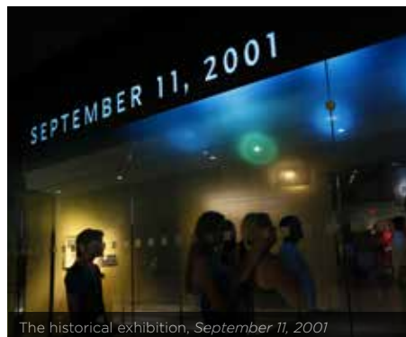
The historical exhibition, September 11, 2001