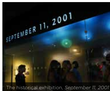
The historical exhibition, September 11, 2001