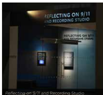
Reflecting on 9/11 and Recording Studio