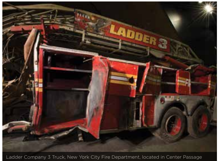
Ladder Company 3 Truck, New York City Fire Department, located in Center Passage