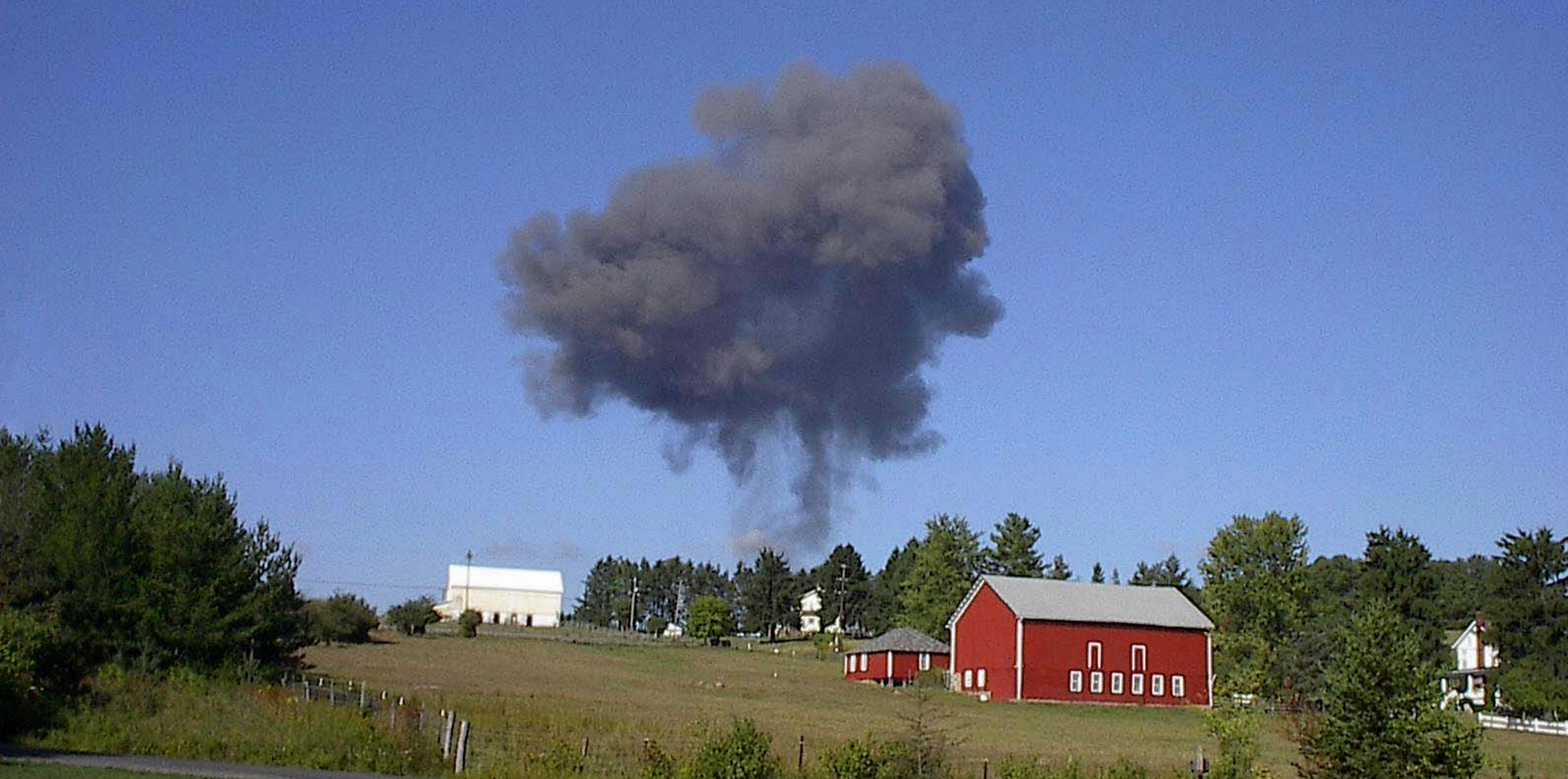
LEFT Somerset County, Pennsylvania, moments after the crash of hijacked Flight 93