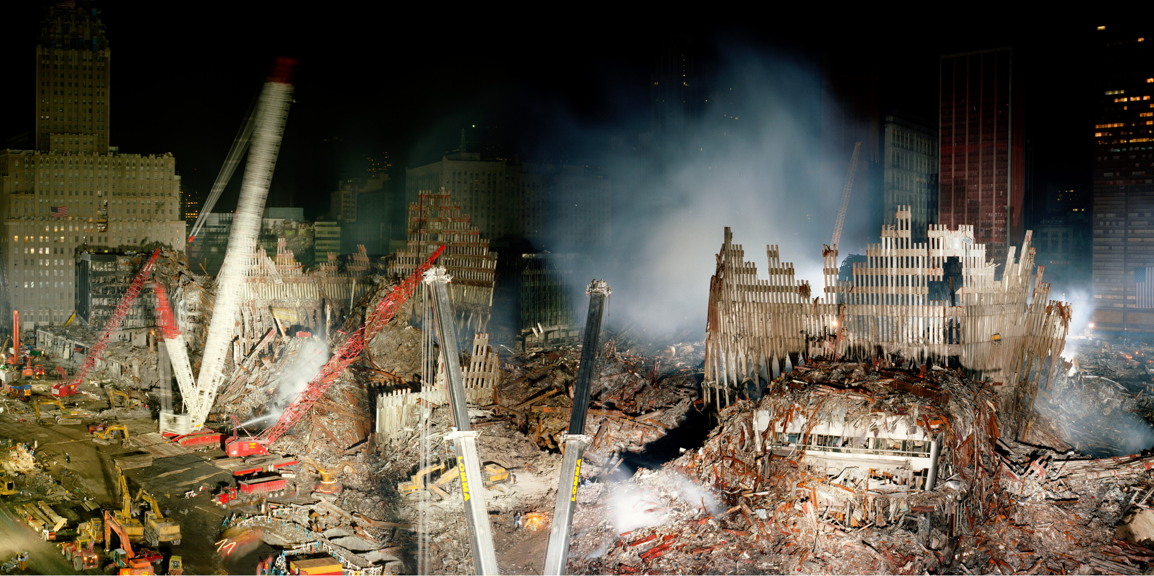
LEFT Ground Zero on September 25, 2001