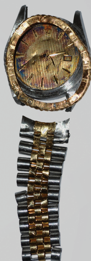
LEFT Watch belonging to Todd M. Beamer