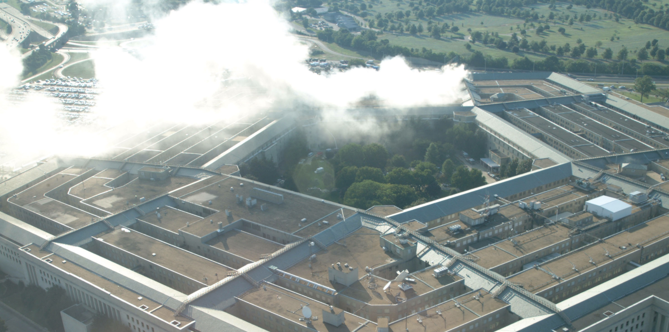
LEFT The Pentagon, Arlington, Virginia