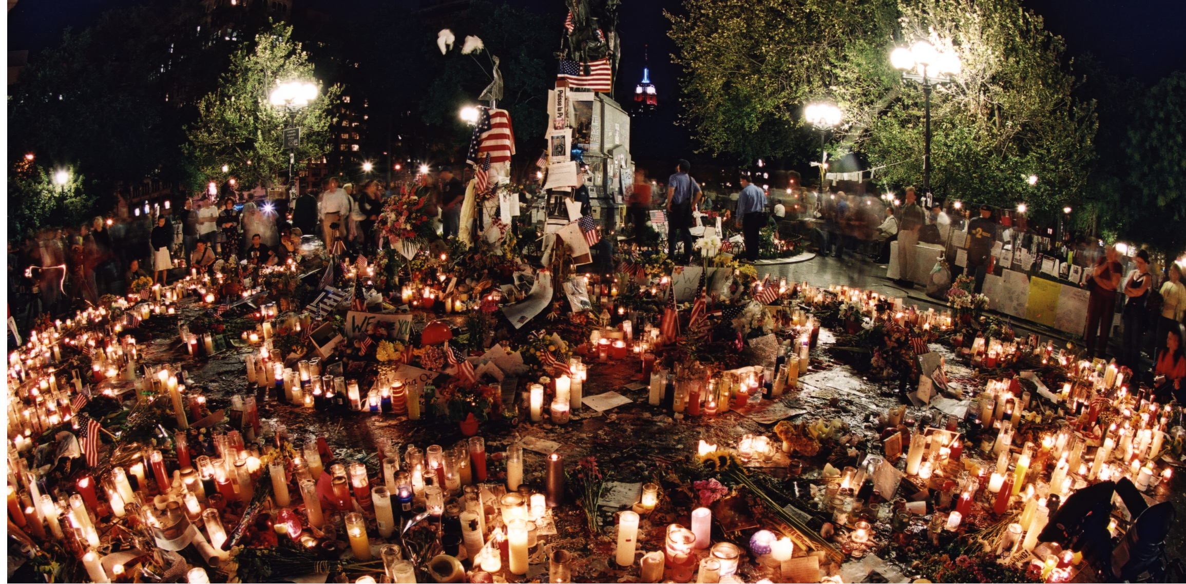
RIGHT Vigil in Union Square Park, New York City